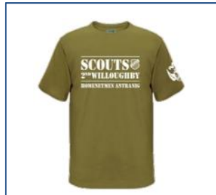
Khaki T-Shirt $15