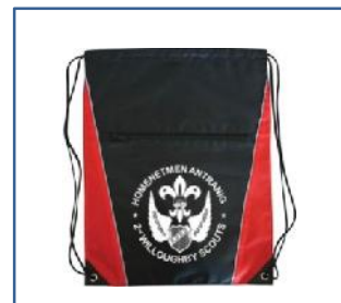
Draw String Bag $10

Badges – upon joining, a number of badges are provided to each Scout – which are to be sewn onto the uniform. Please see the images on the following page showing the correct placement of badges. Please note that if you have been given a second-hand uniform, please remove any earned badges (such as Achievement badges). Scouts should only be wearing uniforms they have earned themselves.