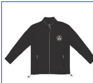
New Navy Jacket $30

Items for sale from Group Support Committee: